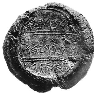
This late seventh-century BC stamp seal impression is written in the Hebrew script and reads, "Belonging to Baruch, son of Neriah, the scribe." Baruch was the scribe of the prophet Jeremiah; he wrote down the book of Jeremiah (Jeremiah 36:1-32).

Jeremiah wrote the longest and most complexly formatted book in the Old Testament. The narrative sections contain many allusions to contemporary history as well as to various people who lived during Jeremiah's lifetime.* Any attempt to date parts of Jeremiah