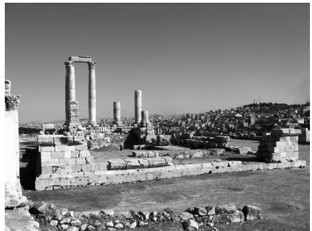
The Roman Corinthian columns of the Temple of Hercules located in Amman, Jordan, at Citadel Hill archaeological park, are a vivid reminder of the ancient cities known to us in Scripture as the Decapolis ( deca = ten; polis = city). Amman has been identified as the city of Philadelphia. These ten cities were centers of Greek and Roman culture located east and west of the Jordan River (Mark 5:18-20; 7:31-35).

Some cite various archaeological finds as “proof” that a particular event really occurred, or that a city or person mentioned in the Bible actually existed. However, the purpose of this book is not to “prove” the