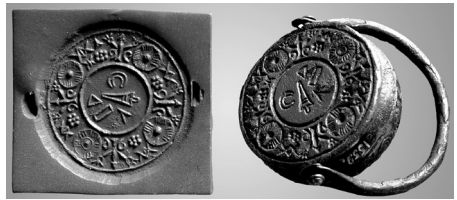
Hittite seal ring.