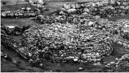
Megiddo stone altar—Early Bronze Age (3200–2200 BC).

that the prince of Megiddo wrote to Egypt in order to request military aid to overcome an attack from the king of Shechem wishing to expand his territory. In addition, Tiglath-pileser III (Assyria) mentions that his armies captured Megiddo in 732 BC. The valley of Megiddo has been the site of many battles both ancient and modern. In ancient times, Ahaziah and Josiah, kings of Judah, were killed there (2 Kings 9:27; 23:29-30). In the modern era, General Allenby defeated the Turks in the same area during World War I.