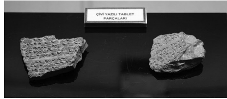
Hittite tablets.

However, this dilemma was quickly solved by discoveries made in the late nineteenth and early twentieth centuries. In 1834, French archaeologist Charles Texier began researching an area about 100 miles east of Ankara, Turkey, near the modern city of Bogazkale, where he noticed the remains of large stone structures. Though these remains were not fully understood, progress was made when A.H. Sayce (in 1876) investigated an unknown language written on stones in Turkey and northern Syria, and when Ernest Chantre (in 1893 and 1894) located several fragments of undecipherable clay cuneiform tablets. These preliminary investigations came to a climax when, in 1906, Hugo Winckler began seven years of excavation that turned the Hittite debate upside down with his discovery of more than ten thousand clay tablets of the royal Hittite library! This discovery was pivotal in establishing the historical presence of the Hittite people and the historical reliability of the Old Testament narratives.