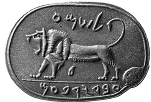
The Shema seal mentioning Jeroboam II.