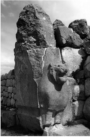
The arched Lion Gate at Hattusha is one of five Hittite gates attached to the city walls.

The New Kingdom started where the Old Kingdom ended, locked in war with the Egyptians and Mittani over the valued region of northern Syria. Ultimately, the Hittite king Suppiluliuma I succeeded in bringing the Hittites the long-desired control of Syria, which expanded the kingdom from the Euphrates River in the east, to the Mediterranean Sea in the west, to Hattusha and Anatolia in the north. In the ensuing years, the Hittites saw more war, and a series of peace treaties were signed with surrounding nations, including Egypt, in order to keep the growing Assyrian army to the east in check. However, the placating and political positioning was short-lived; in the twelfth century BC Hattusha was destroyed by invading tribes from the west, leaving the surviving remnant of the people, known as the “Neo-Hittites,” to live in the southeastern region of the former kingdom. By the ninth and eighth century BC, the Assyrian army pushed west toward Syria, and soon after, Tiglath-pileser III put an end to the remaining Hittite influence in the region.