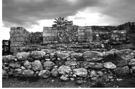
Solomon's casemate gate complex at Megiddo.

Fourth, in the 1950s a portion of a Mesopotamian flood narrative, known as the Epic