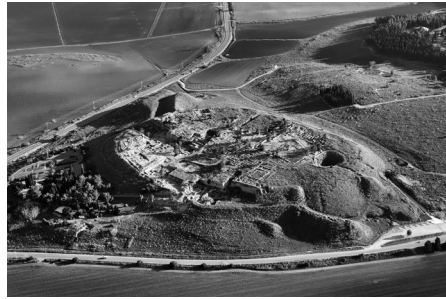
Tel Megiddo.

Megiddo is mentioned in the Bible and attested in extrabiblical sources, the earliest of which recounts the military exploits of Thutmose III (1468 BC) in his attempt to subdue the Canaanite-