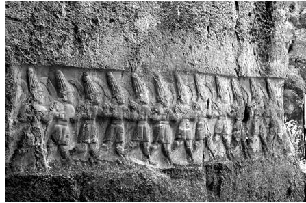
Hittite soldiers carved on rock relief at the Hittite capital city of Hattusha.

The first Anatolian Hittite kingdom (which some call the Old Kingdom) seems to have begun in the seventeenth century BC at their capital city, known as Hattusha (also called Hattusas), under their first king, Labarnas I. The population was mostly comprised of a mixture of people groups indigenous to Europe, Hatti, and northern Syria. A series of tough battles with the Mittani (a rising power located east of the Euphrates) resulted in the Hittites losing control of northern Syria and much of their empire; subsequently the Old Kingdom was brought to an end in about 1400 BC.