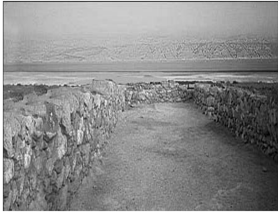
Locus 77, Assembly Hall

Finally, one may note what is missing from the architecture. There are no mosaics, no architectural gardens, no bathhouses. Individual building stones are roughly finished, not polished to perfection. They remain equally rough on the interior. Extended colonnades and stoas were not incorporated into the architecture. Instead, privacy, interiority, and practicality seem to have been the principles that guided the architecture of Qumran.