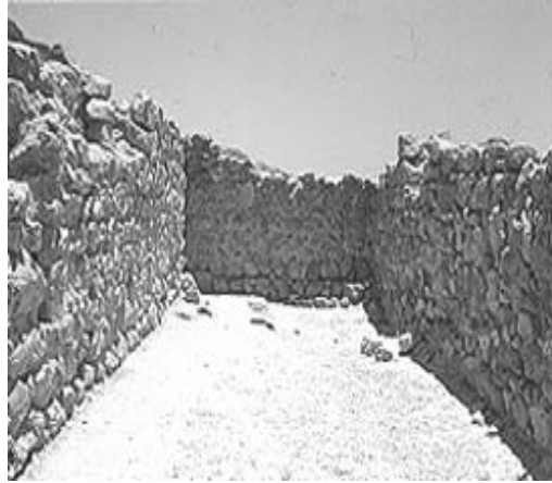
Inside the Locus 30, the “Scriptorium”