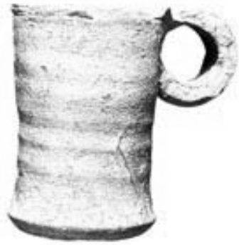
Inkwell from Qumran.

It may be possible that in time, with further discoveries in the region, additional proposals will be found for understanding the relationships between Qumran, the nearby caves, and their manuscripts. Some specialists today are willing to consider the possibility that several groups might have placed manuscripts in the caves, with the Qumran group being the most prominent.