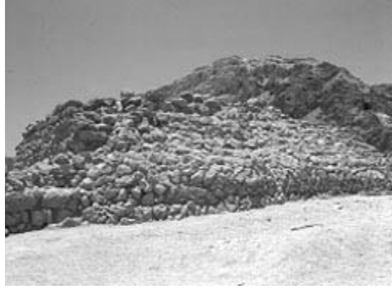
The Tower at Qumran

tion. Based upon some important architectural similarities to contemporary manor houses (e.g., Horvat 'Eleq), Yizhar Hirschfeld has argued that the architecture of Qumran is best understood as a “fortified manor house,” a square complex forming a central courtyard, with a security tower on the perimeter. Of course, Qumran possesses archi-