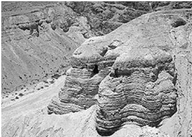
Qumran Cave 4

In the following year, bedouin discovered yet another cave (Cave 2). Nearby Cave 1, this new cave hardly contained as many important finds. Nevertheless, the remains of biblical manuscripts, Ben Sira, and Jubilees were found. Later in 1952, professional archaeologists finally discovered their first cave (Cave