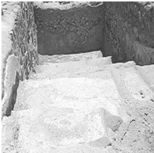
Locus 56, Miqveh Near the Assembly Hall

gathered the waters that ran down from the cliffs during the raining season and carried them into the water channels that meandered through the heart of the site. The system was sealed with plaster and covered with stone slabs to keep water from escaping. Several of the cisterns probably also served as ritual baths, or miqva'ot , especially those that have steps (Loci 138, 118, 117, 56, 48, 71). Stairs leading down into the cisterns allowed for descent and ascent. In the Torah, ritual