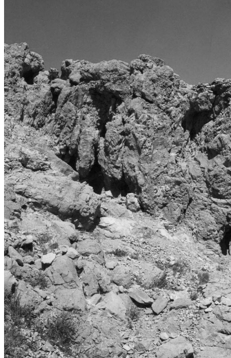
Qumran Cave 1

descend easterly through the steep inclines of the Judean wilderness and into the Dead Sea. While tending their flocks, ed-Dhib's cousin, Jum'a Muhammad Khalil, had thrown a rock into a nearby cave, creating an unusual shattering sound within. Later, ed-Dhib ascended into the cave to discover the source of this sound. Inside he found at least eight clay jars, one of which had provided the shattering sound of the previous day. Inside one of these jars were three beautifully preserved scrolls: the Great Isaiah Scroll (1QIsa a ), the Commentary on Habakkuk (1QpHab), and the Rule of the Community (1QS = 1Q28).