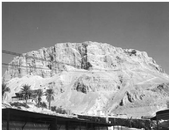
Masada: Last Stand of the Jewish Revolt

Others prefer to see the Qumran group as more